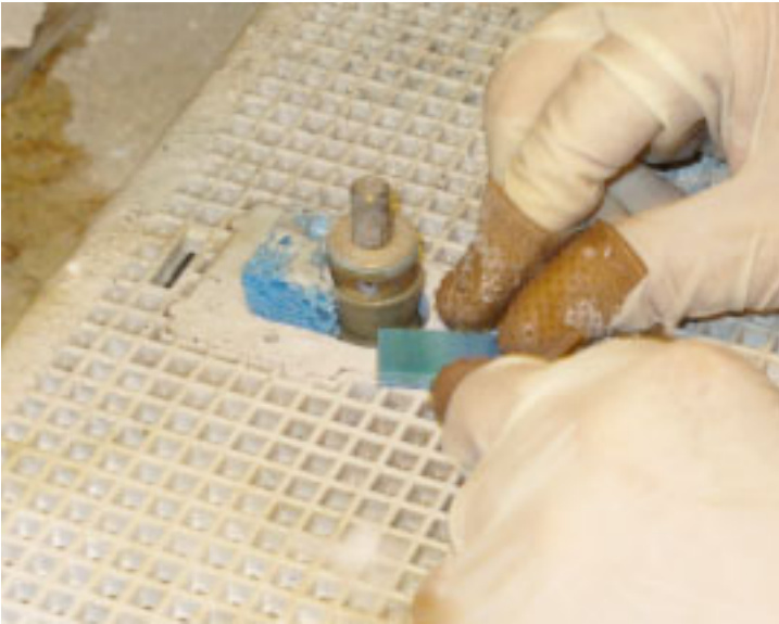
3. Each piece is grinded to remove sharp edges.