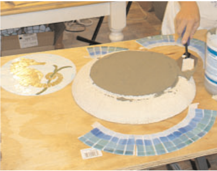
7. Top sections of mortar is spread first.