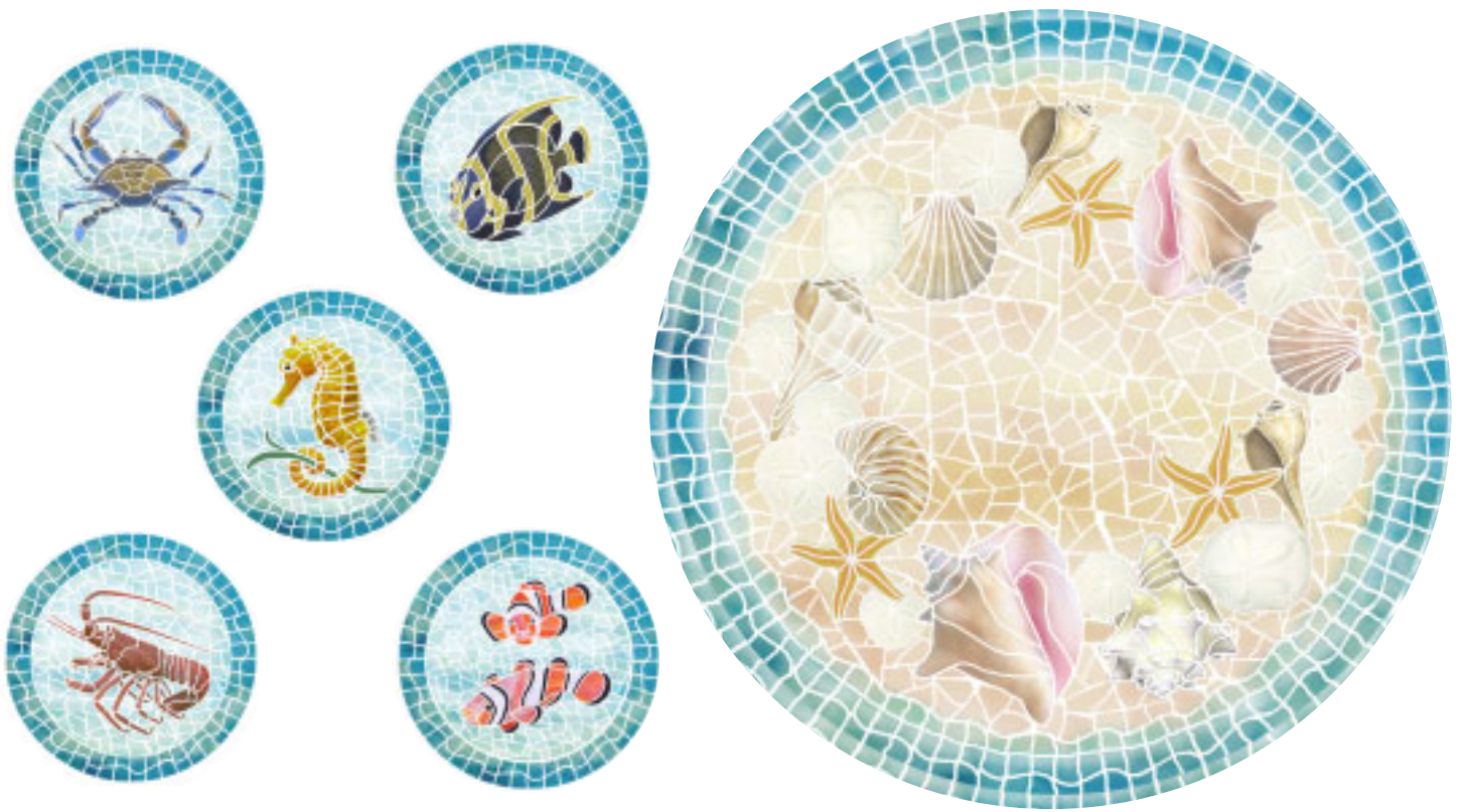
Above: custom table and seat designs presented to customer for pool area. Below: finished product.