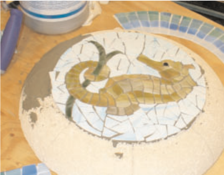
9. Pieces are checked for shifting and adjusted.