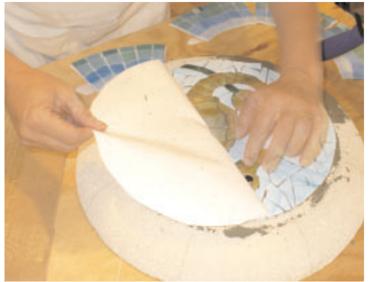
8. Top sections are positioned and paper removed.