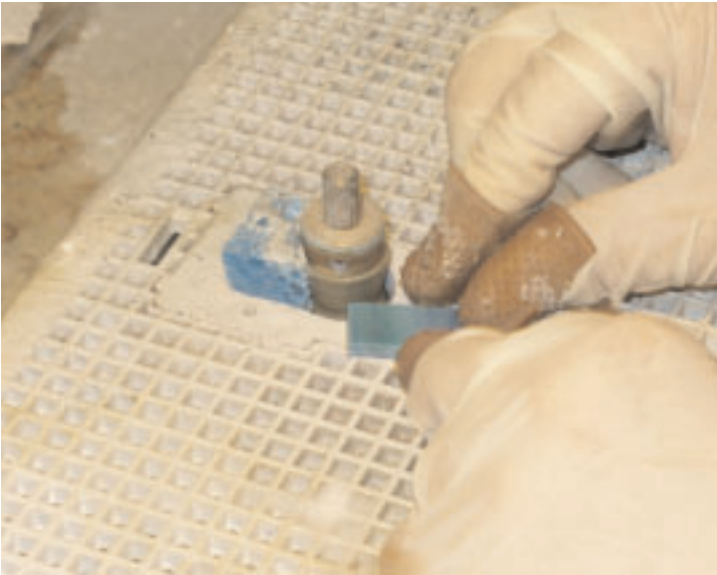
3. Each piece is grinded to remove sharp edges.