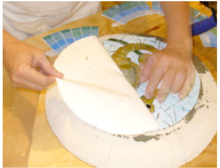
8. Top sections are positioned and paper removed.