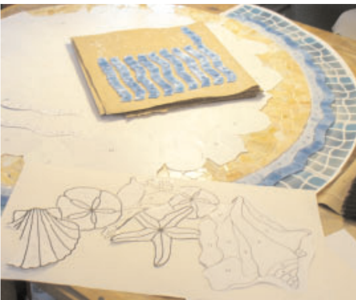
5. Sections are secured with contact paper.