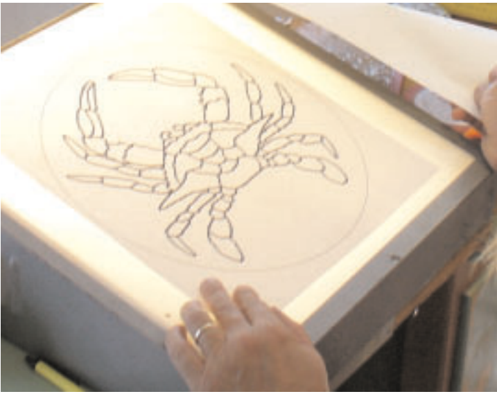
1. Once the design is done, a template is made.