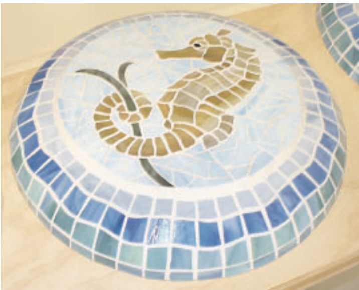
11. Grout is applied and glass is buffed clean.