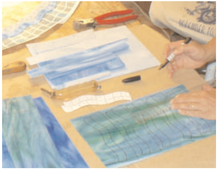
2. Patterns are arranged onto sheet glass and cut.