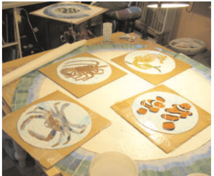
6. Patterns are inverted and adjusted for spacing.