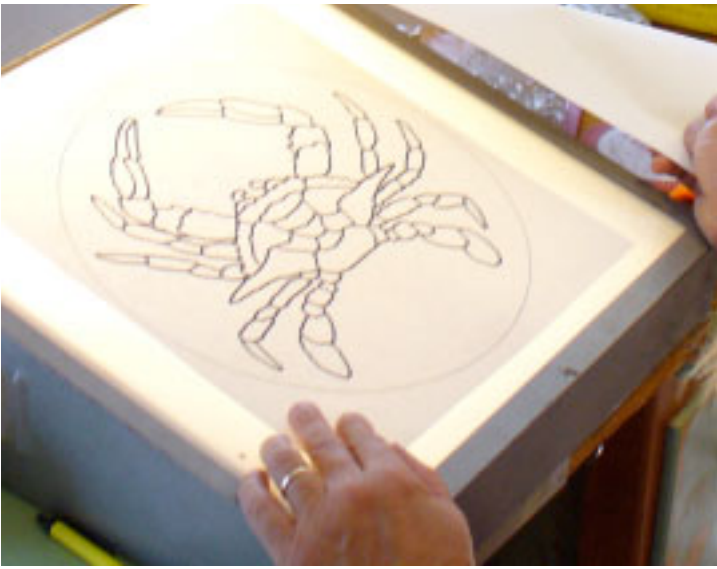
1. Once the design is done, a template is made.