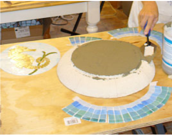
7. Top sections of mortar is spread first.