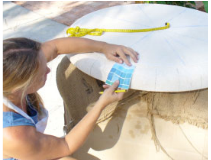
10. Sides are fitted and applied, piece by piece.