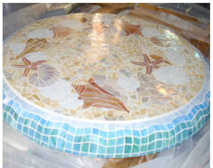
12. This project took about a month to complete.