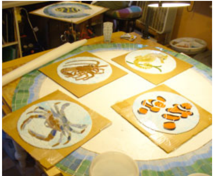
6. Patterns are inverted and adjusted for spacing.