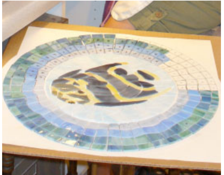
4. The glass is carefully positioned and fitted.