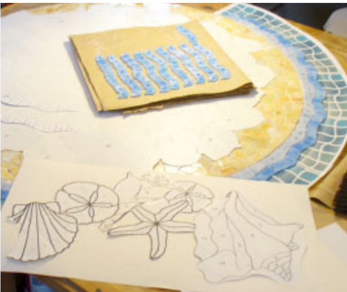
5. Sections are secured with contact paper.