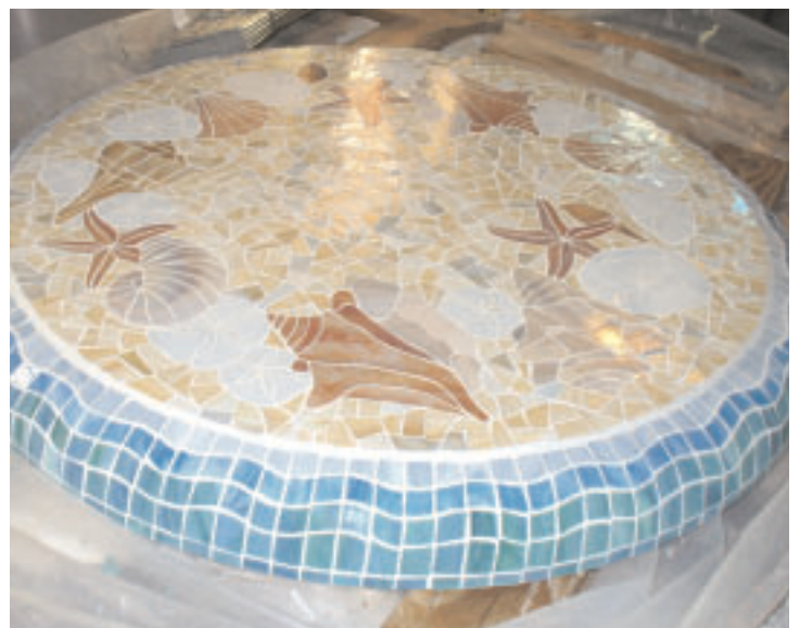
12. This project took about a month to complete.