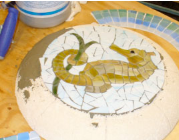
9. Pieces are checked for shifting and adjusted.