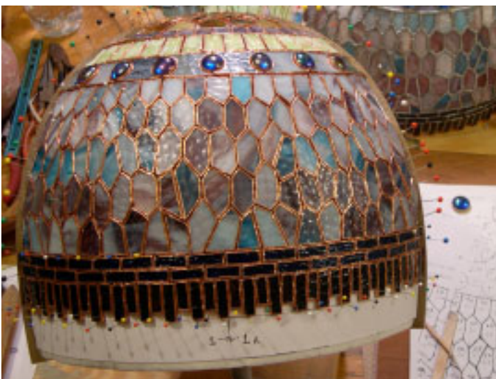
4. Each piece is wrapped with copper foil tape and positioned on the form, held in place by pins.