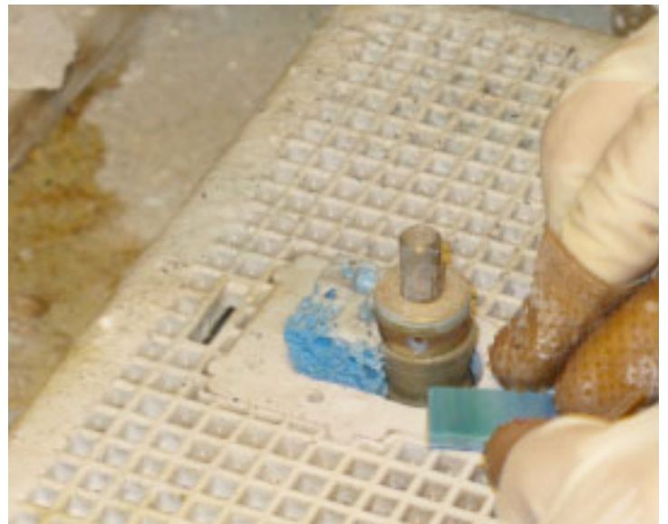
3. All the edges are ground and shaped to fit.