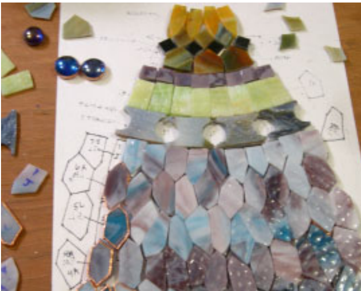
2. Pieces are traced and cut from sheets of glass.