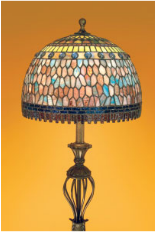
"Blue Daze" Floor Lamp