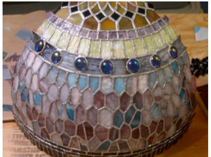
5. Sections are soldered and joined together; 6. Lastly, a patina and wax finish is applied.